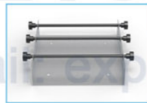
Clamping Rod Shaking Plate